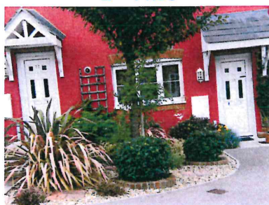
2 nd Prize